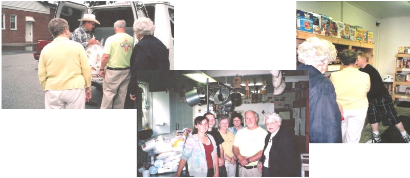
Edgemont Baptist made a supply run to the Kennedy Home in Kinston

NOTE: If you are moving or have an address change, please call the associational office. Your help is greatly appreciated!